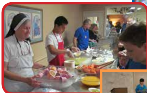
above - Spaghetti Dinner event