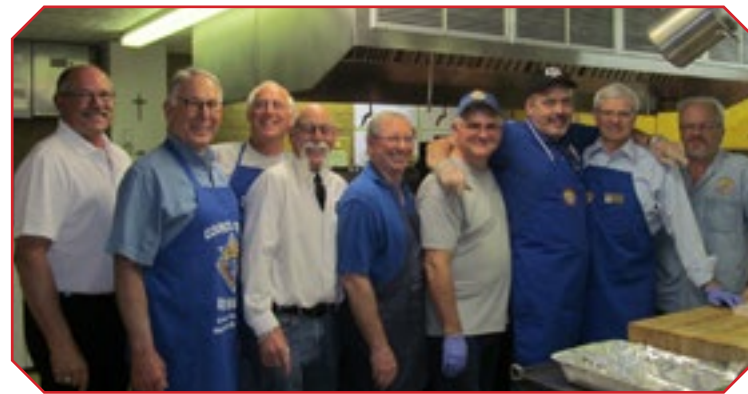
Members of the St. Peter's Knights of Columbus also donated their time at the event (Above Knights helping in the kitchen)