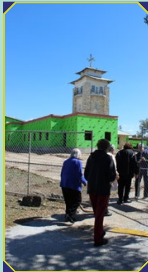
The Sisters, prepare to embrace the new Monastery