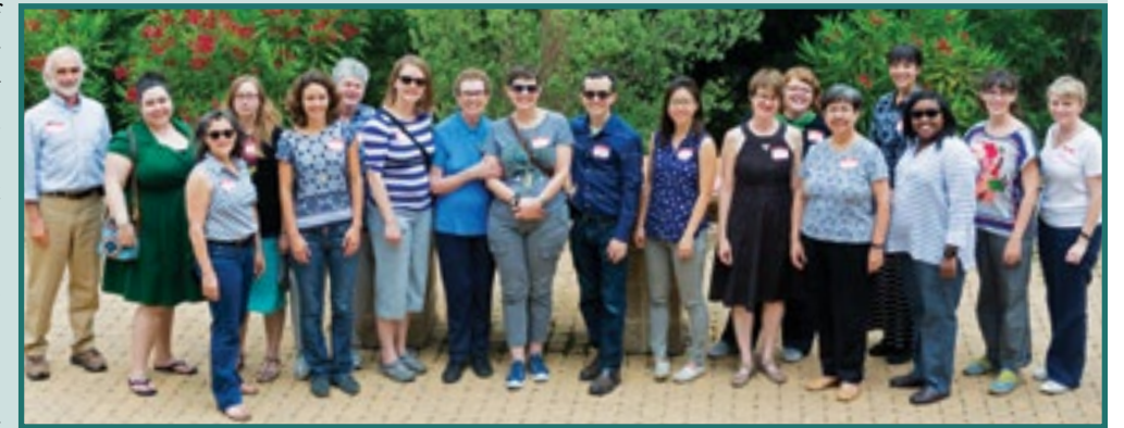
CPPP staff with some of the Benedictine Sisters during their visit

"The CPPP staff carpoled down wildflower-studded back roads to spend the day with our founders, the Benedictine Sisters of Boerne, Texas. It was a journey back to our roots and core values.