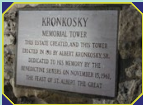
The new Monastery is built around the renowned Kronkosky Tower