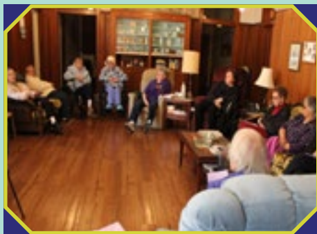
The Sisters gather in community at the Omega residence to share memories