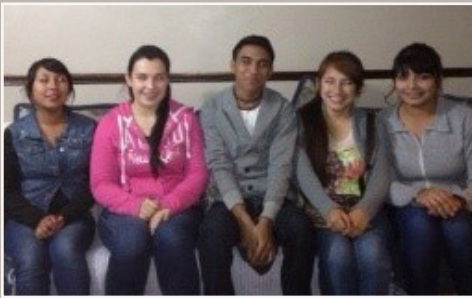
Students who receive tuition

"I can do things you cannot, you can do things I cannot; together we can do great things."