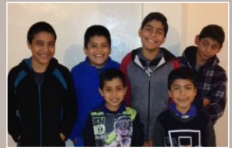
Boys from the orphanage