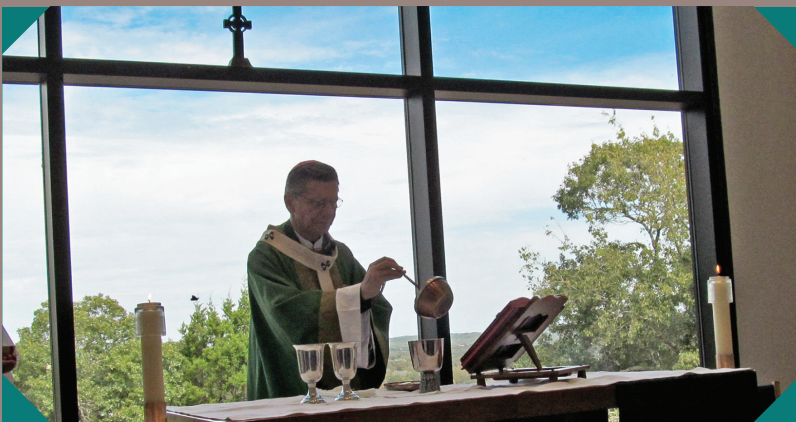
Archbishop Gustavo García-Siller, MSPS blesses the altar in the new Chapel