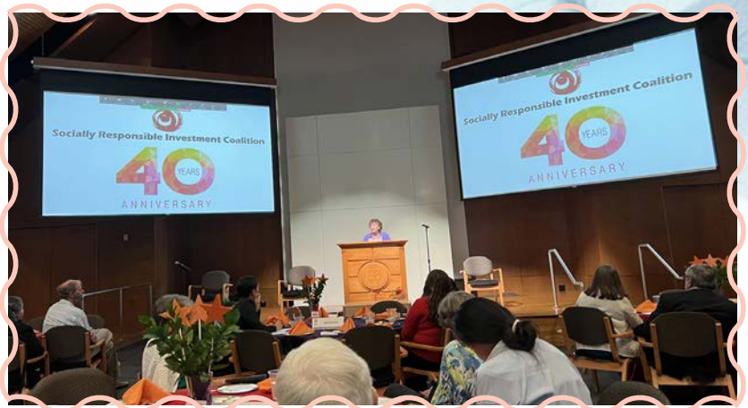
The event, held at the Whitley Theological Center, was well attended.

The event, SRIC @ 40: (Still) Looking for the Promised Land , marked four decades of the nonprofit organization's advocacy for workers' rights and safety, food safety and sustainability, water stewardship and sustainability, human rights, health, climate change, clean energy, corporate governance, and financial practices and risk.