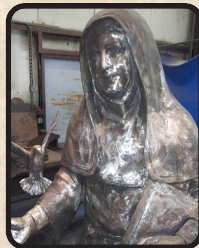
Ready for sandblasting, then patina