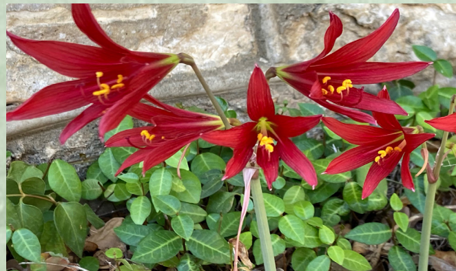
(Above clockwise) Lush gardens near the Haider-Kean Inn (formerly Children's Inn); yellow Senna blooms near the Omega Office area; swimmer figurines decorate a healthy Potato Plant in a nook by the pool, and vibrant Oxblood Lilies adorn the gardens.