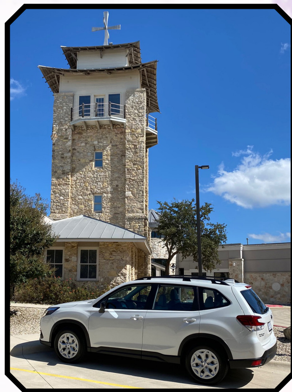
(Above) A brand new Subaru Forrester arrived at the Monastery in late October thanks to the generosity of an anonymous donor!