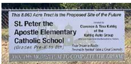
Photo above - Sign on the fenceline of the recently sold property