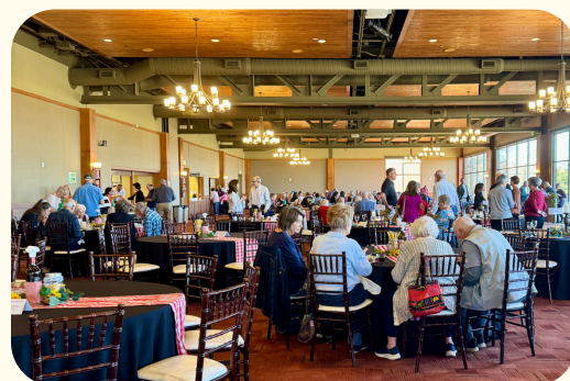
A lovely group gathered at the Cana Ballroom at St. Peter the Apostle Catholic Church to support the Sisters for the Feast of St. Benedict celebration.