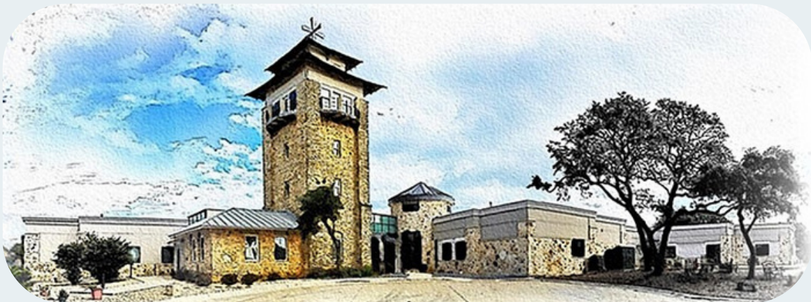
St. Scholastica Monastery, Boerne, TX