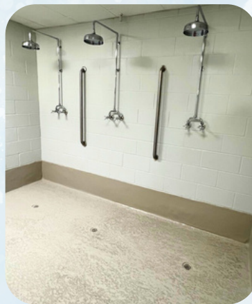
New rain showerheads were installed in the bathhouse.