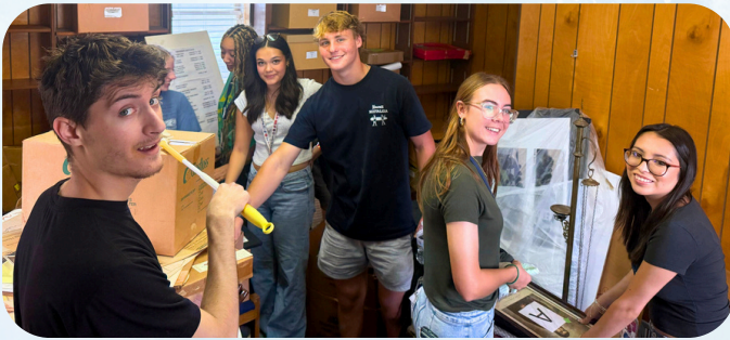
Boerne Champion High School seniors organized, dusted and moved items in the tower.