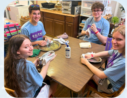
Boerne High School seniors shined and polished dishes at Sisters' Attic.