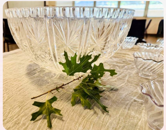
The Sisters had their own ritual to honor and reflect on this ministry. During that time, they blessed the water which was used for the group's closing blessing of Omega.